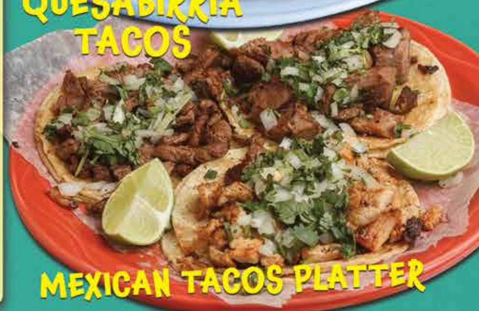
MEXICAN TACOS PLATTER