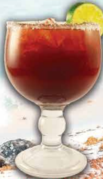
POMEGRANATE MARGARITA ROCKS