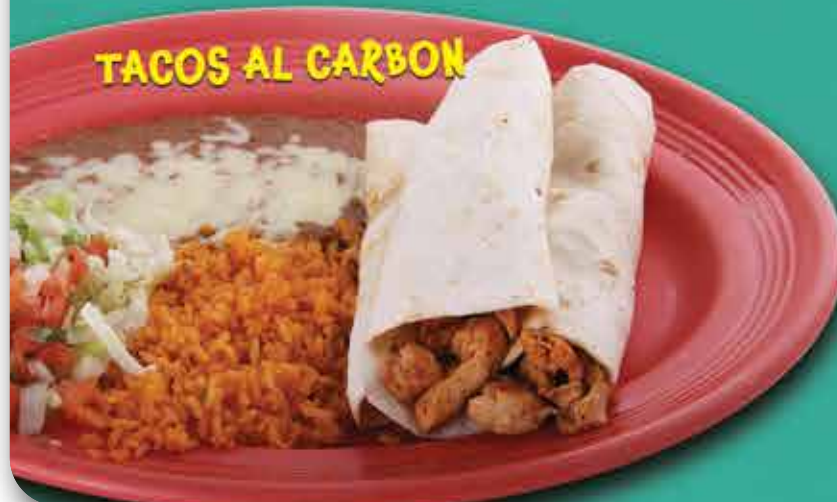
TACOS AL CARBON