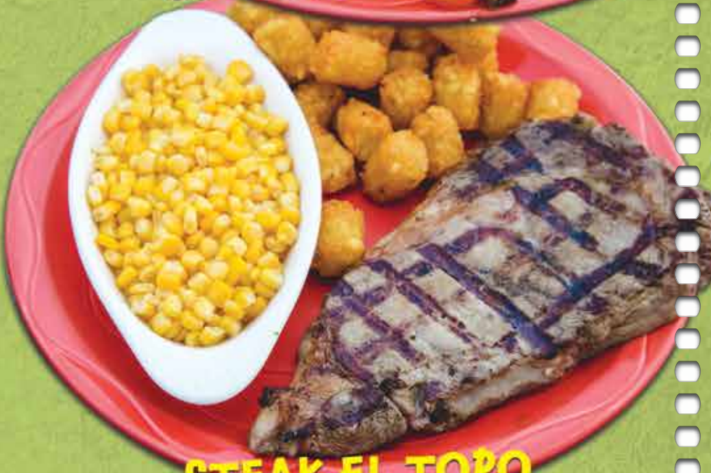
STEAK EL TORO