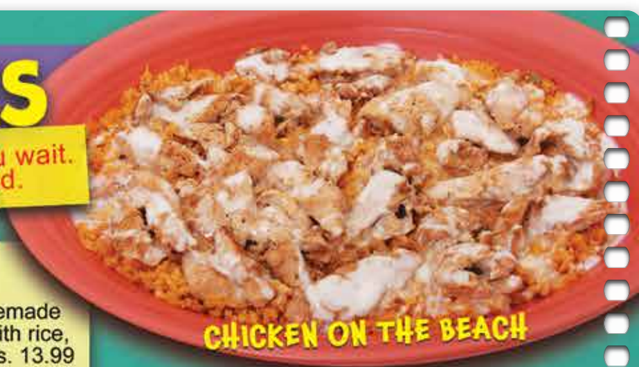
CHICKEN ON THE BEACH