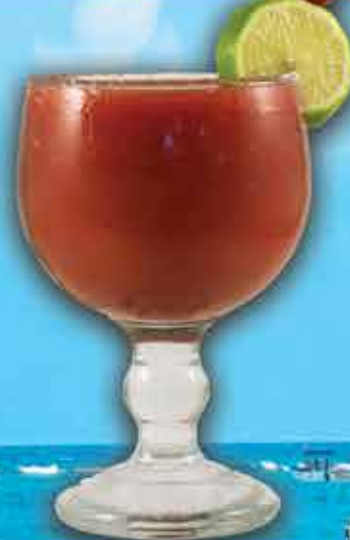
FROZEN RASPBERRY MARGARITA