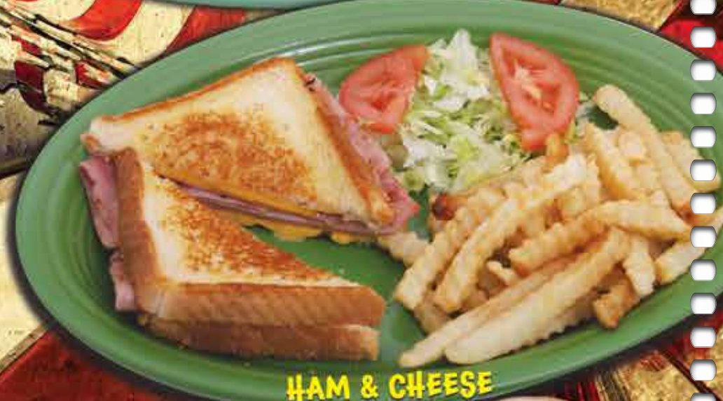
HAM &amp; CHEESE