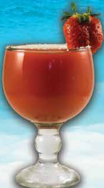
FROZEN STRAWBERRY MARGARITA