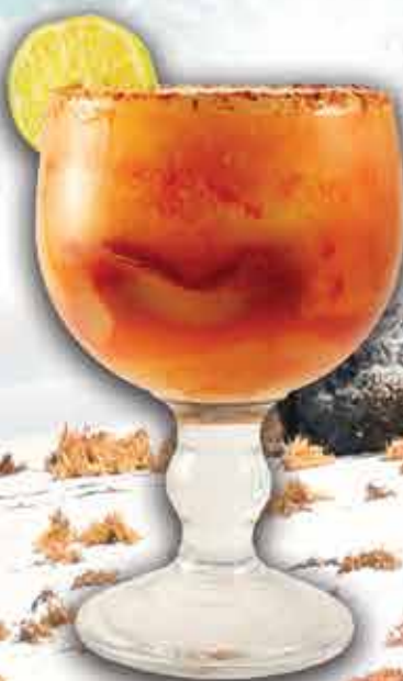
FROZEN CHAMOY MARGARITA