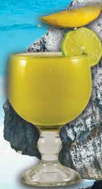
FROZEN MANGO MARGARITA