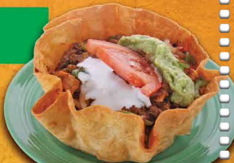
TACO SALAD MONTERREY

Lettuce, shredded cheese, hard boiled eggs, ham, turkey, tomatoes, and cucumber, with your choice of dressing. 12.29