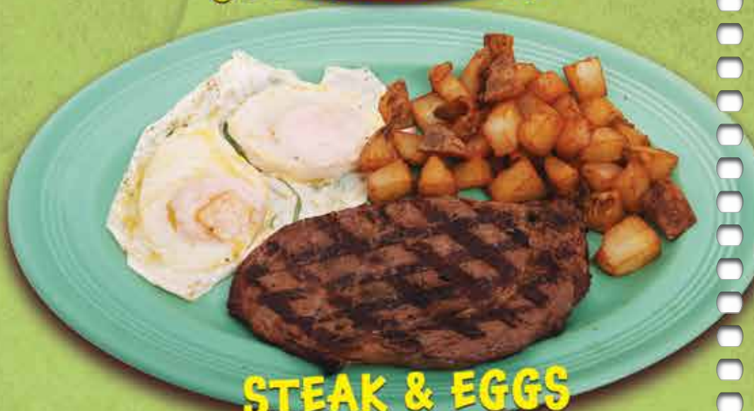
STEAK & EGGS