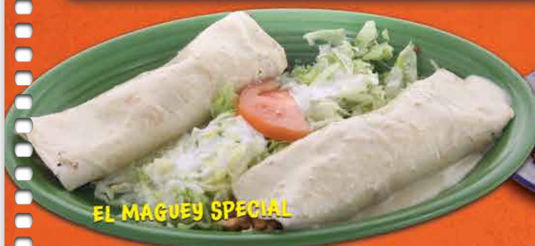
EL MAGUEY SPECIAL