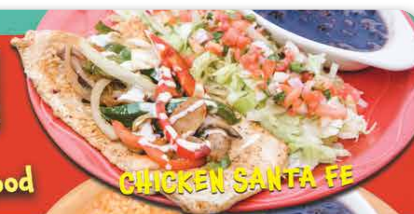
CHICKEN SANTA FE