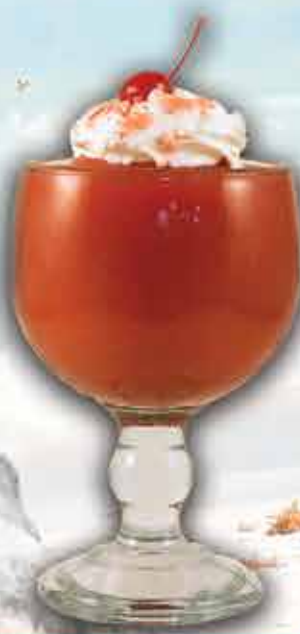
FROZEN STRAWBERRY DAIQUIRI