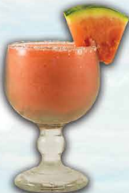
FROZEN WATERMELON MARGARITA