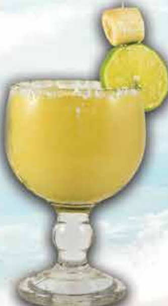
FROZEN BANANA MARGARITA