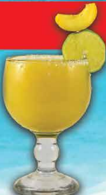
FROZEN PEACH MARGARITA