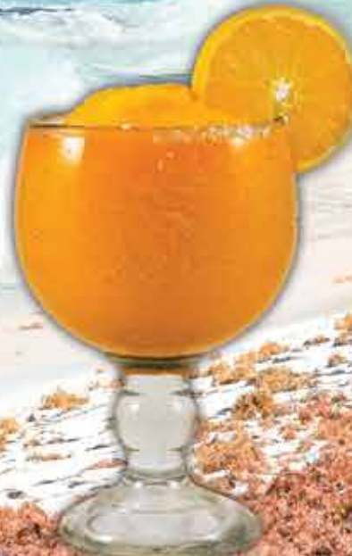
FROZEN ORANGE MARGARITA