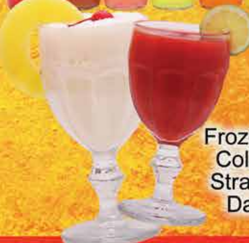
Frozen Piña Colada or Strawberry Daiquiri