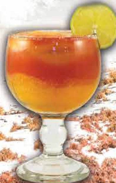
FROZEN TROPICAL MARGARITA