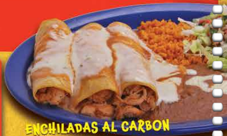
ENCHILADAS AL CARBON

Four enchiladas, one chicken, one bean, one cheese, and one beef, topped with lettuce, sour cream, and pico de gallo. 13.29 with flour tortillas $1.00 extra