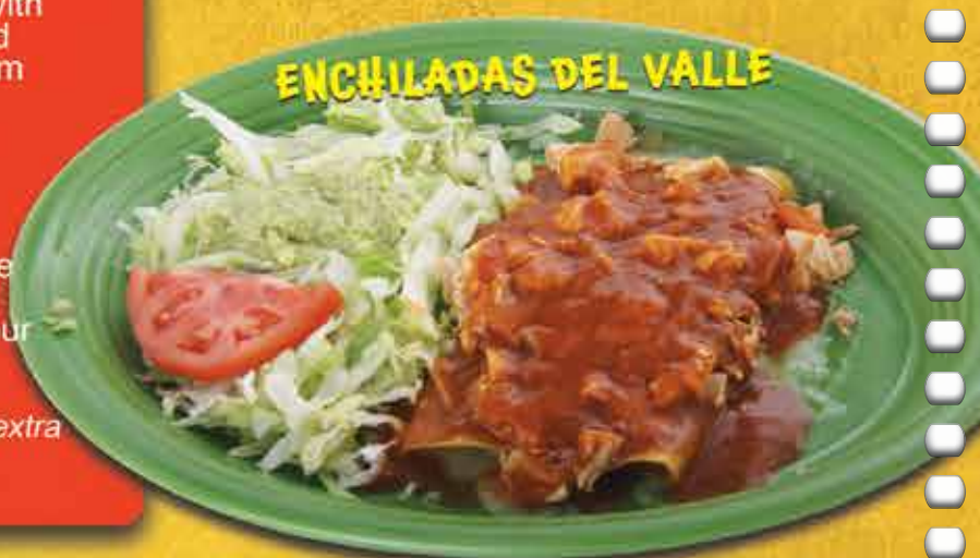
ENCHILADAS DEL VALLE