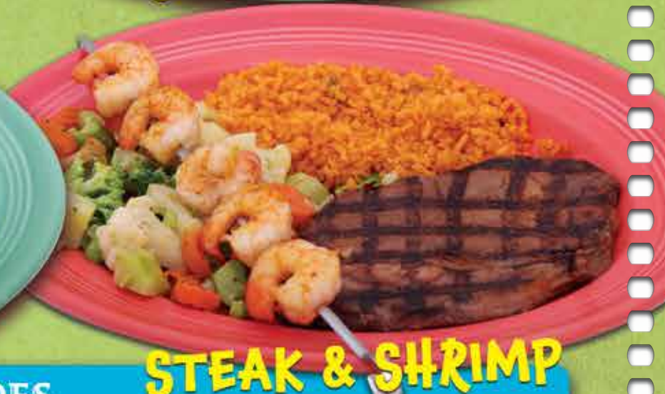
STEAK & SHRIMP