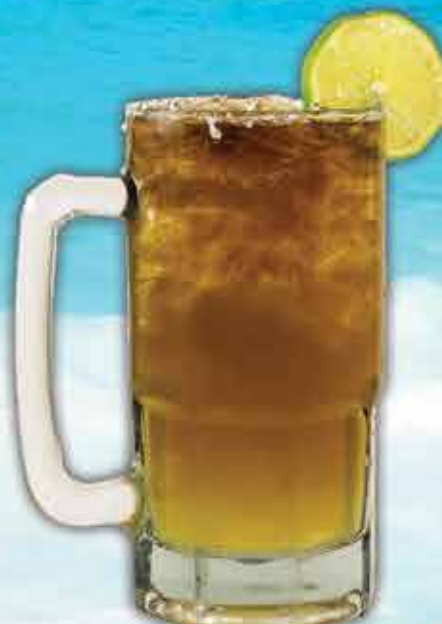
LONG ISLAND ICED TEA Small Medium Large