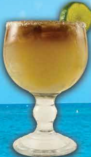
MARGARITA TEXANA TOP SHELF