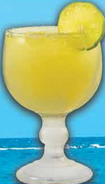
LIME MARGARITA ROCKS